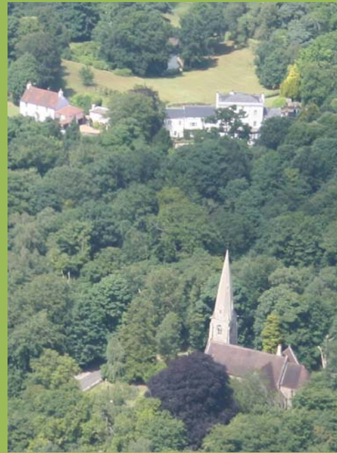
Arabin House and from the air in 2008

He served as an inspector in the Metropolitan Police Special Constabulary at Waltham Abbey during the war years and appears in two known photographs dated 1916 and 1919.